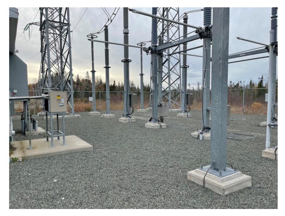
Photo 3 : Transition compound – post insulators, disconnect switches and main gantry.