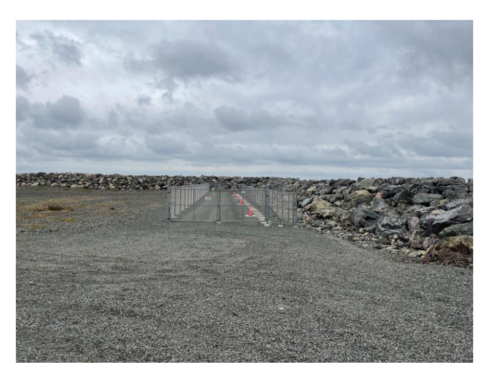
Photo 5: Grounding site - grounding wells with electrodes under precast concrete covers inside the fenced enclosure.