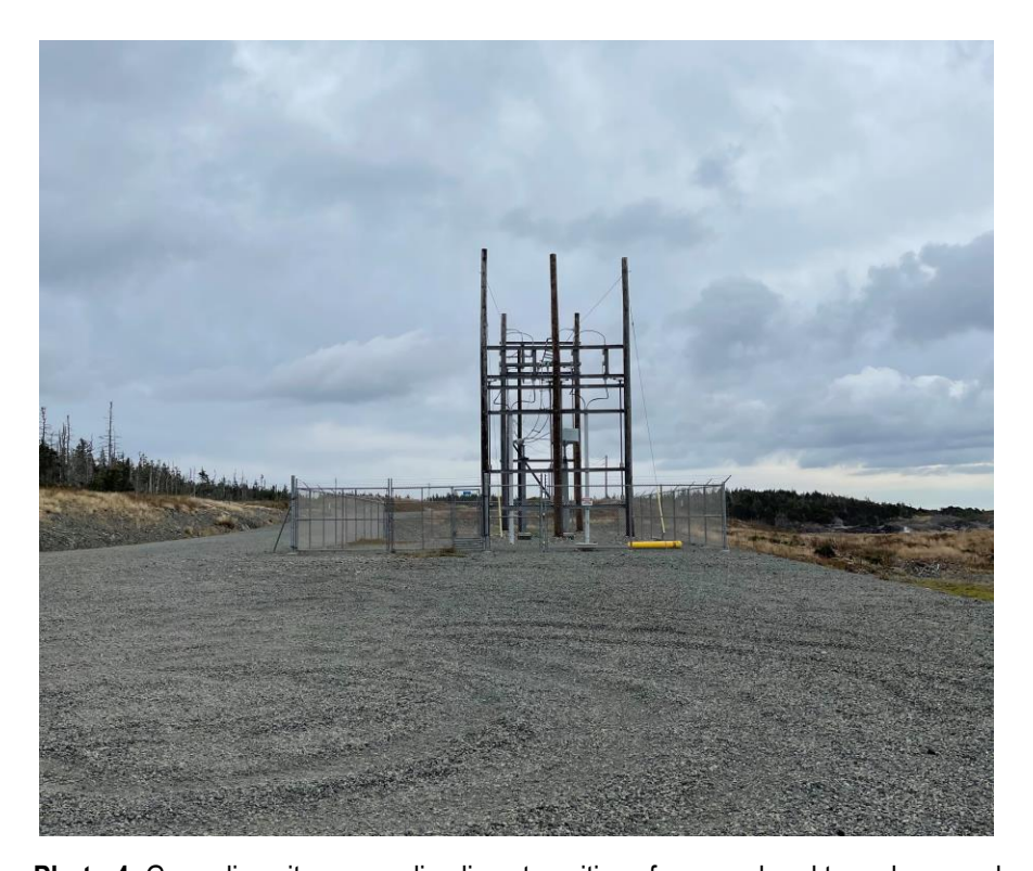
Photo 4: Grounding site - grounding lines transitions from overhead to underground.

IE visit was facilitated by Craig Snelgrove. The facility has been well maintained and was in perfect order.