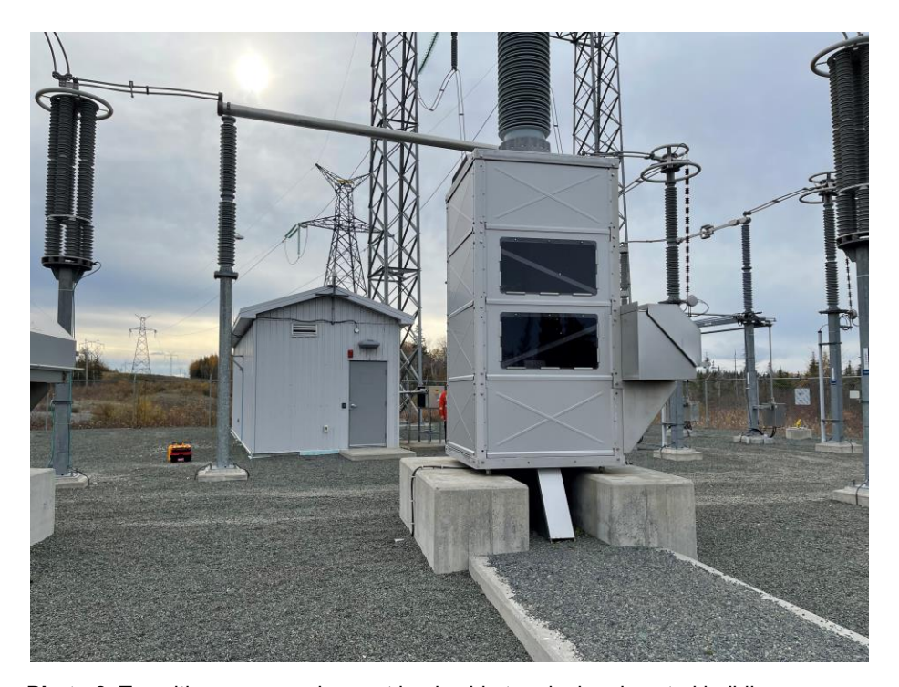
Photo 2: Transition compound – west land cable terminal and control building.