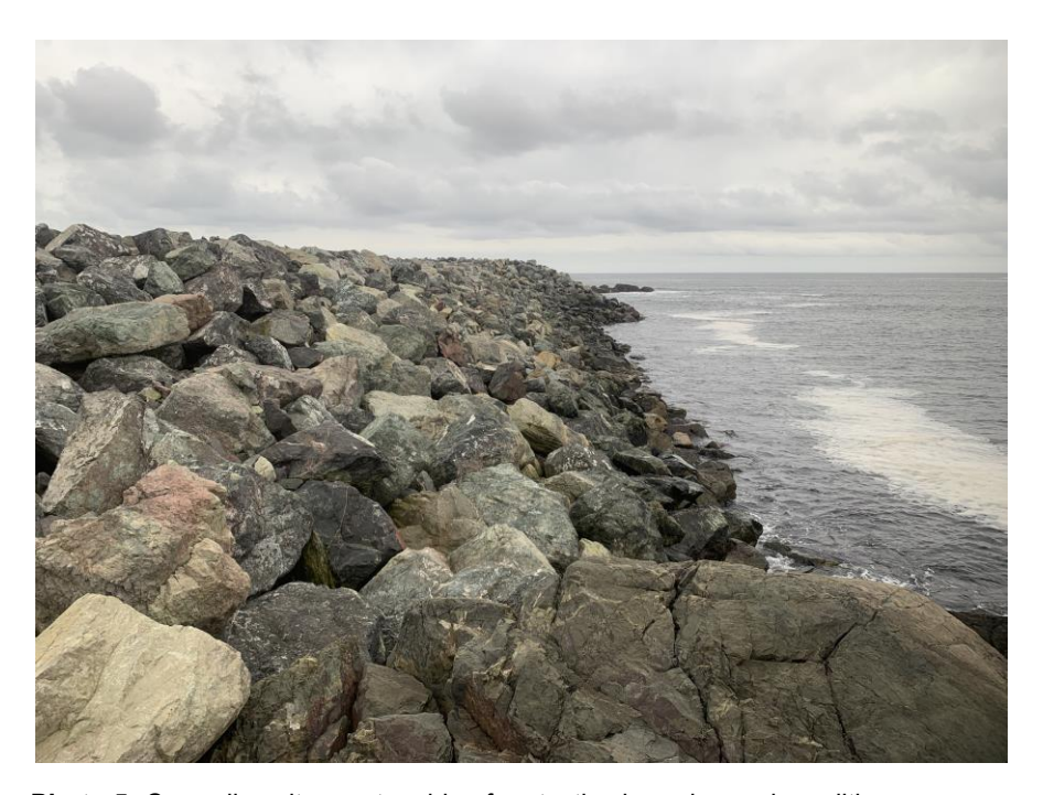
Photo 5: Grounding site – outer side of protective berm in good condition.