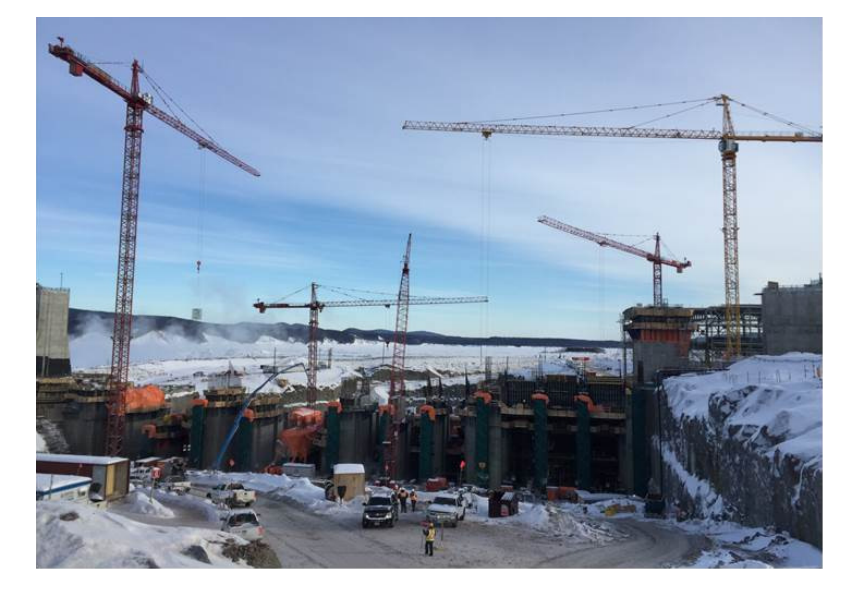
Ongoing construction by Astaldi of the Muskrat Falls powerhouse

Work also progressed on other components of the Muskrat Falls hydroelectric generation facility: