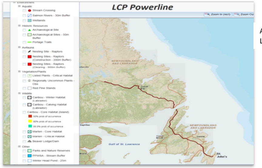
An overview screen shot of the LCP Powerline tool

This powerful tool provides a number of benefits in facilitating LCP environmental management and compliance. Powerline allows for regulatory agencies to monitor progress and construction activities from their computer and assists personnel in completing reports and processing approvals. Powerline also provides up-to-date and continual access to information for construction personnel regarding environmental constraints.